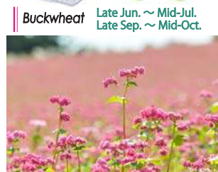
Buckwheat Late Jun. ~ Mid-Jul. Late Sep. ~ Mid-Oct.