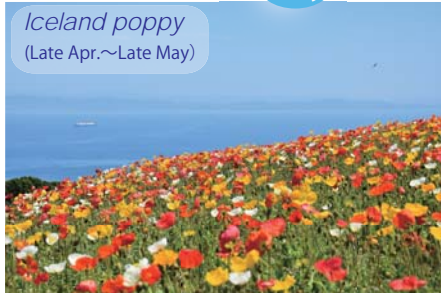
Iceland poppy (Late Apr.~Late May)