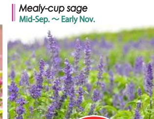
Mealy-cup sage Mid-Sep. ~ Early Nov.