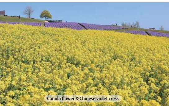
Canola flower & Chinese violet cress

We sell the local produce such as Awaji onions, tomatoes, and other vegetables and the processed seafood as well. We can also provide a wide selection of souvenirs of Awaji island.