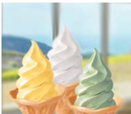
Popular soft serve ice cream