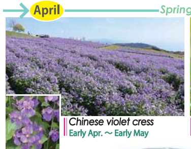
Chinese violet cress Early Apr. ~ Early May