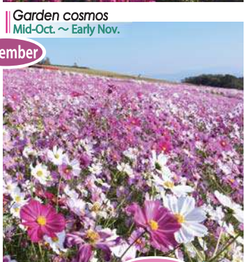
Garden cosmos Mid-Oct. ~ Early Nov.