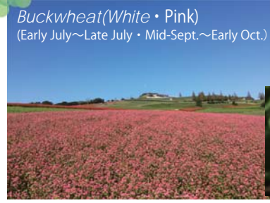
Buckwheat(White · Pink) (Early July~Late July · Mid-Sept.~Early Oct.)