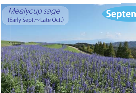
Mealycup sage (Early Sept.~Late Oct.)