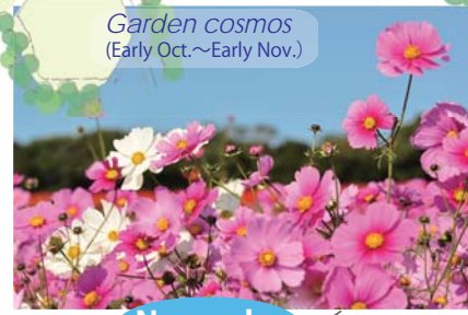
Garden cosmos (Early Oct.~Early Nov.)