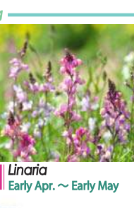
Linaria Early Apr. ~ Early May