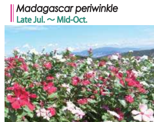
Madagascar periwinkle Late Jul. ~ Mid-Oct.