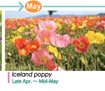
Iceland poppy Late Apr. ~ Mid-May