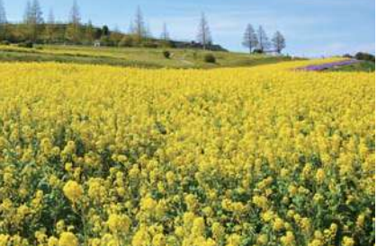
March Turnip rape Early Jan. ~ Late Apr.