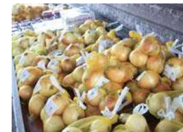
Awaji Island specialty onions