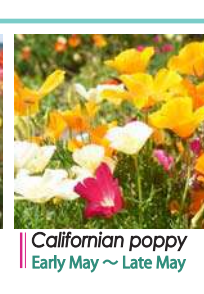
Californian poppy Early May ~ Late May