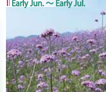
Purpletop vervain Early Jun. ~ Early Jul.