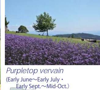
Purpletop vervain (Early June~Early July · Early Sept.~Mid-Oct.)