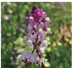
Clovenlip toadflax (Mid-Apr.~Early May)

Awaji Hanasajiki is a vast flower field of about 15 hectares located at an altitude of 300 meters in the northern part of Awaji Island. You can enjoy spectacular view of the sea and sky over the carpet-like flower field.