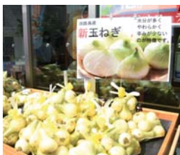
Awaji Island specialty onions