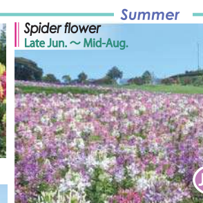
Spider flower Late Jun. ~ Mid-Aug.