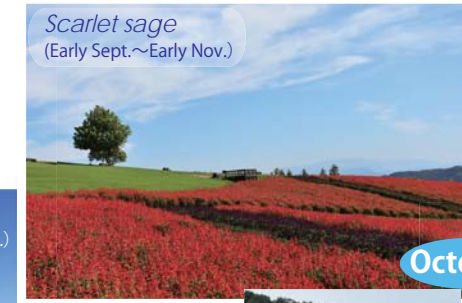
Scarlet sage (Early Sept.~Early Nov.)