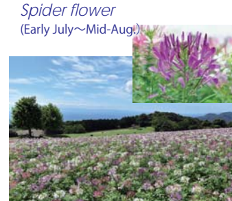
Spider flower (Early July~Mid-Aug.)