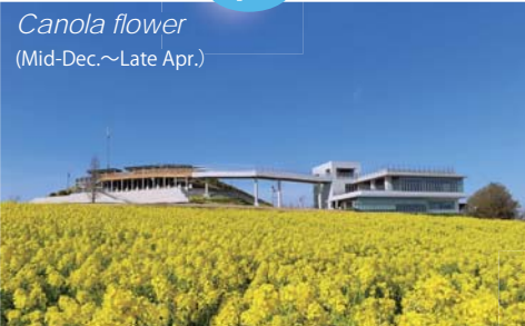
Canola flower (Mid-Dec.~Late Apr.)