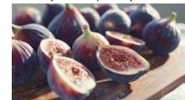
Awaji Island specialty figs