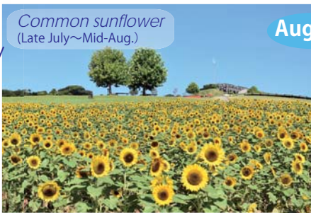
Common sunflower (Late July~Mid-Aug.)