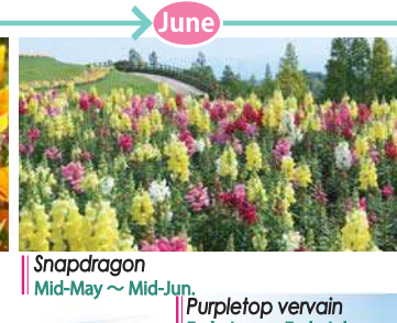
Snapdragon Mid-May ~ Mid-Jun.