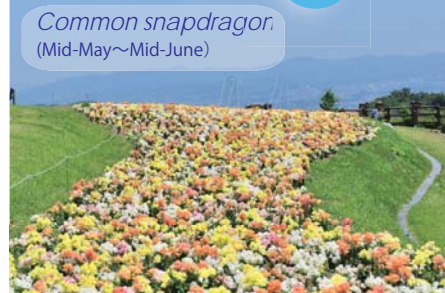
Common snapdragon (Mid-May~Mid-June)