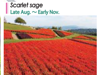
Scarlet sage Late Aug. ~ Early Nov.