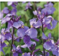
Chinese violet cress (Mid-Apr.~Early May)