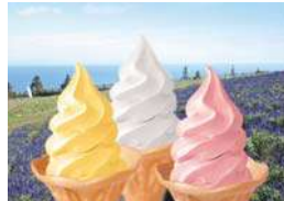
Popular soft serve ice cream

※The types may vary depending on the season.