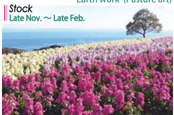
Stock Late Nov. ~ Late Feb.